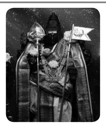
Kukuta Homam (Curb all your Negativity)