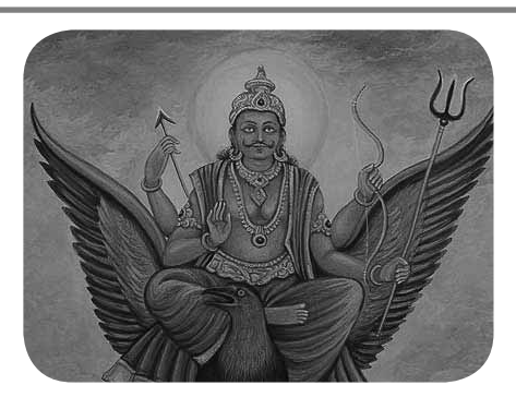
Saturn Homam (Your Stepping Stones to Success)