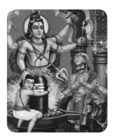
Rudra Homam (Curb all your Negativity)